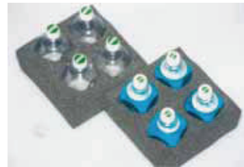
RCTW-1031-1 vials, set of 4, RCTW-1031-2 buffer vials, set of 4, for testing fresh concrete