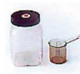
RCT-1030 set of calibration liquids RCT-1000-1 electrode wetting agent RCT-1032 mixing container and cup

It is recommended to always have an extra set of clean RCT-1030 calibration liquids to ensure that the chloride electrode is working properly should deviations occur from the usual obtained calibration curve. The RCT-1000-1 EWA (electrode wetting agent) contains 300 mL of liquid for refilling of the RCT-1000 EWA bottle, which has a spout that fits into the electrode hole. The RCT-1032 mixing container and cup is for testing samples of fresh concrete.