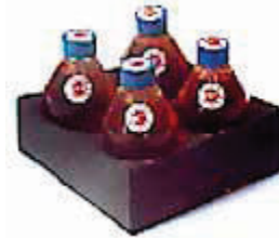
RCT-1031 vials, set of 4, for testing fresh concrete

Extraction liquids for RCTW testing for water-soluble chlorides in hardened concrete or fresh concrete: