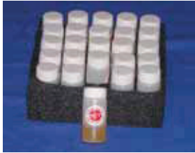
RCT-1023 vials, set of 25, for testing hardened concrete

Extraction liquids for RCT testing for acid-soluble chlorides in hardened concrete or fresh concrete: