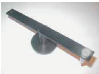
RCT-995 the 1.5 g balance for checking the powder weighing ampoules supplied in the RCT-500 kit