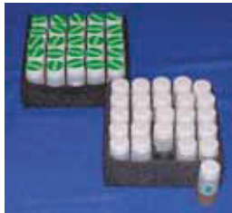
RCTW-1023-1 vials, set of 25, RCTW-1023-2 buffer vials, set of 25, for testing hardened concrete

Extraction liquids for RCTW testing for water-soluble chlorides in hardened concrete or fresh concrete: