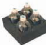
RAT-2032 Vials for fresh concrete