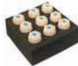
RAT-2023 Vials for hardened concrete