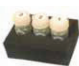
RAT-2030 Calibration liquids