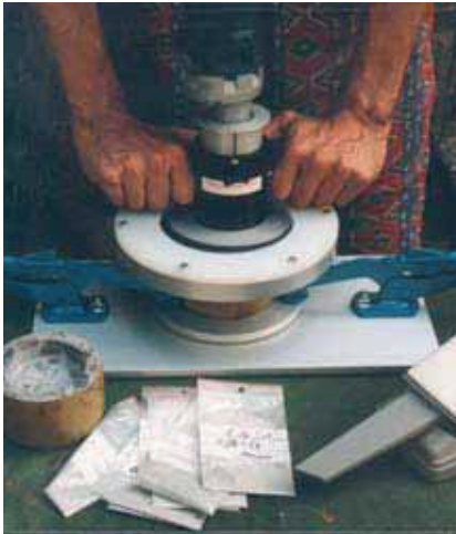
Profile grinding of specimen subjected to 35 days of ponding in the laboratory. Chloride content of each sample is determined using the RCT (page 112)