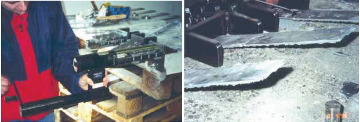
DSS-TEST being performed to determine anchorage load of bonded CFRP strips (left) and typical failures (right)