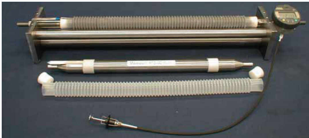
Principal components of the Auto-Shrink system